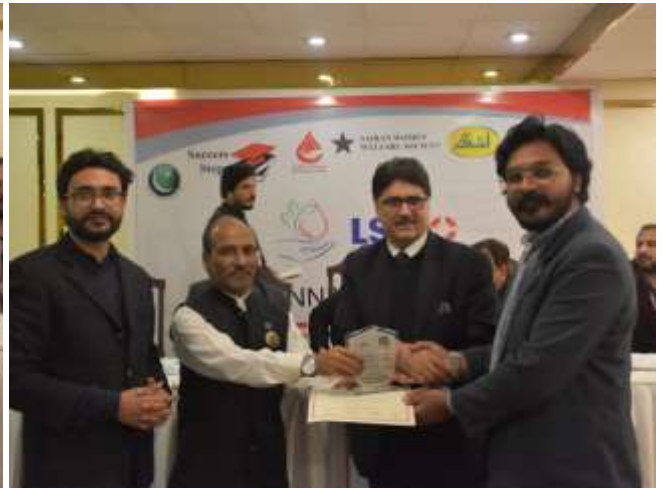
IHRC Chief addressing and distributing Awards in the Volunteers Award Ceremony (2019)