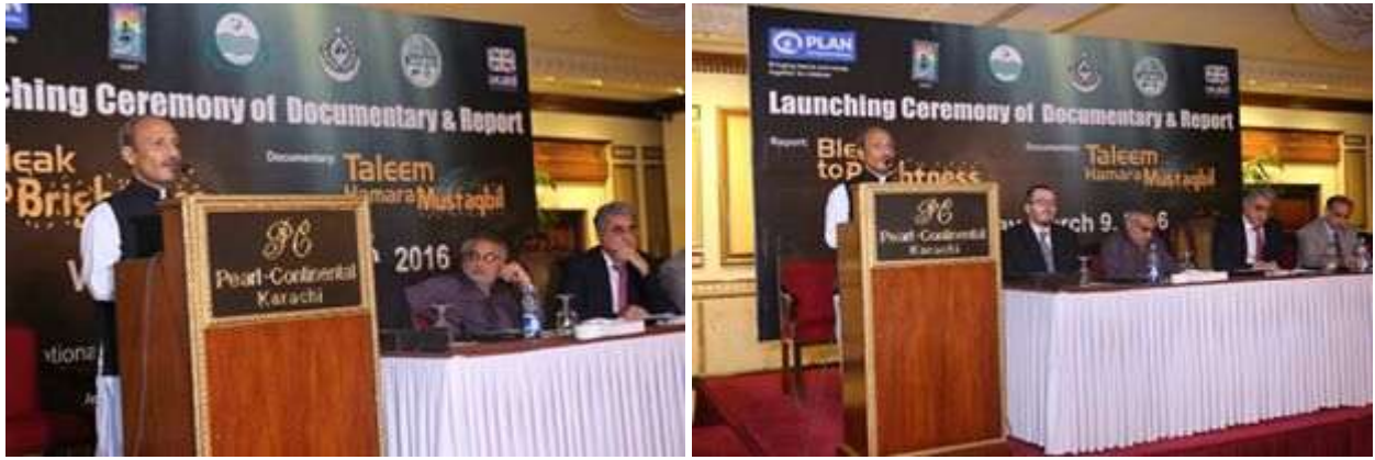
IHRC Chief addressing the Launching Ceremony of Documentary & Report of Plan International at Karachi-Pakistan on Education (2016)