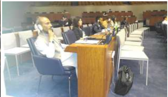
IHRC Chief participating in the UN General Assembly meetings as Observer organization 2017