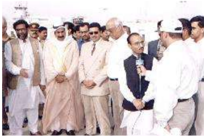
IHRC Chief along with Governor Sindh Muhammad Mian Soomro receiving the Kuwaiti Aid for the drought in Thar desert on the request of International Human Rights Commission (2005)