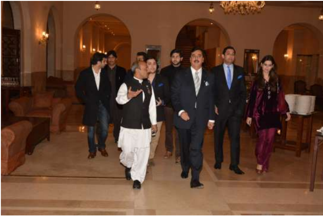
18 th Prime Minister of Pakistan Excellency Syed Yousaf Raza Gillani with IHRC Chief (2016)