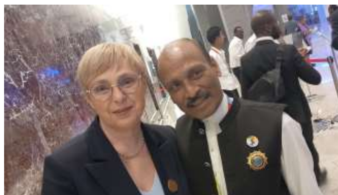
H.E Ms. Natasa Pirc Musar, President of the Republic of Slovenia along with IHRC Chief during the Summit