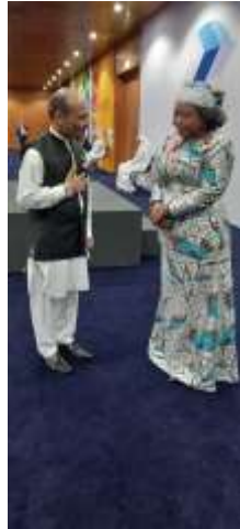
H.E Ms. Esperança Maria Eduardo Francisco da Costa, Vice-President of the Republic of Angola meets with IHRC Chief and accepted the invitation to be Keynote speaker at the 7 th World Summit on Human Rights 2024 at Geneva, Switzerland and also discussed to establish the bilateral cooperation between Angola and IHRC