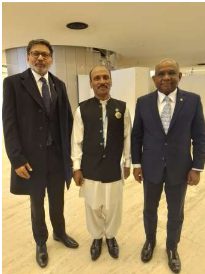
H. E Abdullah Shahid, Minister for Foreign Affairs of Maldives meets with the IHRC Chief along with Maldives Ambassador to United Nations Geneva