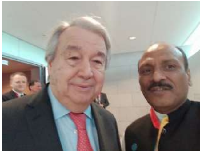
H.E Antonio Guterres, Secretary General of UNO with the IHRC Chief during the 5 th UN LDC'S Summit at Qatar