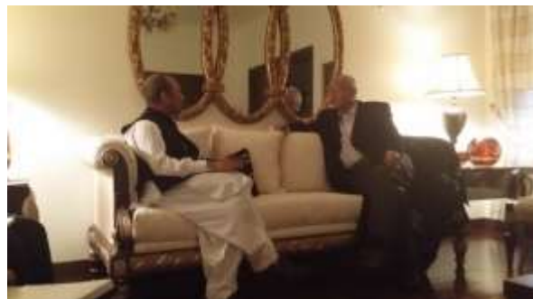
IHRC Chief in discussion with General Masoud Aslam (Former Crops 11 Commender of Pakistan Army) on the regional sitution and development in Afganistan (2016)