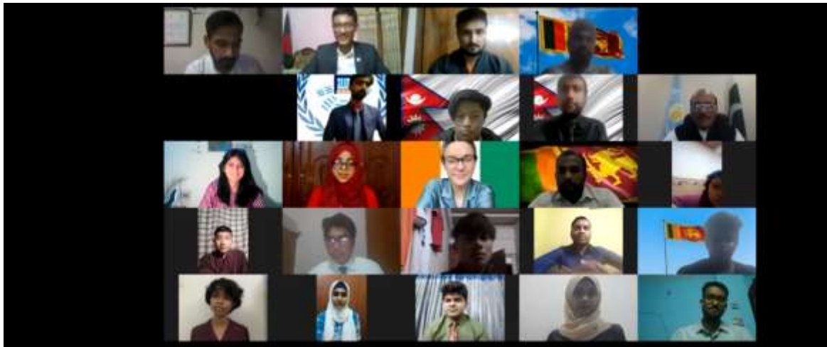
IHRC Chief addressed the 3 rd Model Youth SAARC Summit 2021 as the Keynote Speaker (2021)