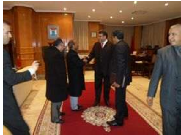
IHRC Chief presenting bilattial accord to the Excellency Mahjoub El Haiba Interministerial Delegate for Human Rights of the Kindom of Morroco and in left having meeting with Excellency Mustapha Ramid Minister of Justice of Morroco (2013)