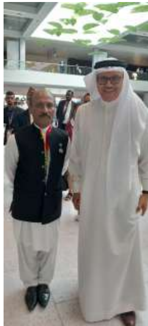
H.E Mr. Abdullatif bin Rashid Al Zayani, Minister of Foreign Affairs Bahrain meets with IHRC Chief and discussed to strengthen the bilateral cooperation between Bahrain and IHRC and accepted the invitation to be Keynote speaker at the 7 th World Summit on Human Rights 2024