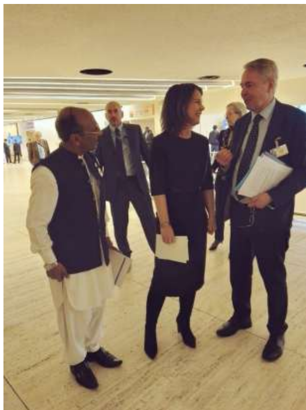
H.E Ms. Annalena Charlotte Alma Baerbock, Federal Minister for Foreign Affairs of Germany, H.E Pekka Haavisto, Minister for Foreign Affairs of Finland in discussion with the IHRC Chief during the 52 nd Session of UN HRC at Geneva, Switzerland