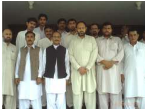
IHRC Chief addressing the Journalist delegation of Press Club at Islamabad-Pakistan 2008