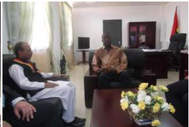
IHRC Chief Signing the Charter of Commission with the Secretary of State for Foreign Affairs and in meeting with Excellency Faustino Fudut Imbali Foreign Minister of Republic of Guniea Bassaue to discuss implementation of bilatral accord signed by IHRC & Guniea Bassaue (2013)