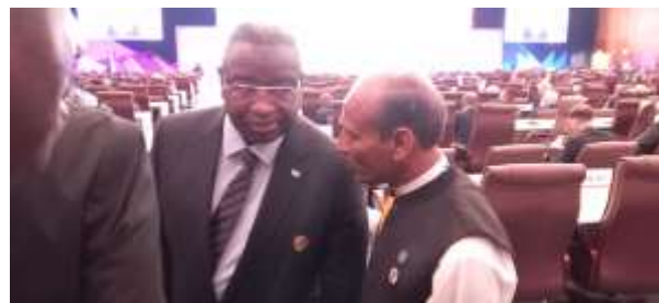
H.E. Mr. Julius Maada Bio, President of the Republic of Sierra Leone and IHRC Chief in discussion to establish the bilateral relations between the IHRC and Sierra Leone