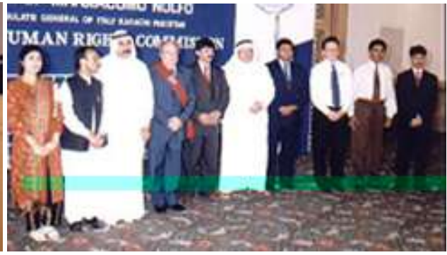
IHRC Chief honoring the Consul General of Italy at Karachi during the celebration of Human Rights along with diplomats stationed at Karachi, Pakistan (2003)