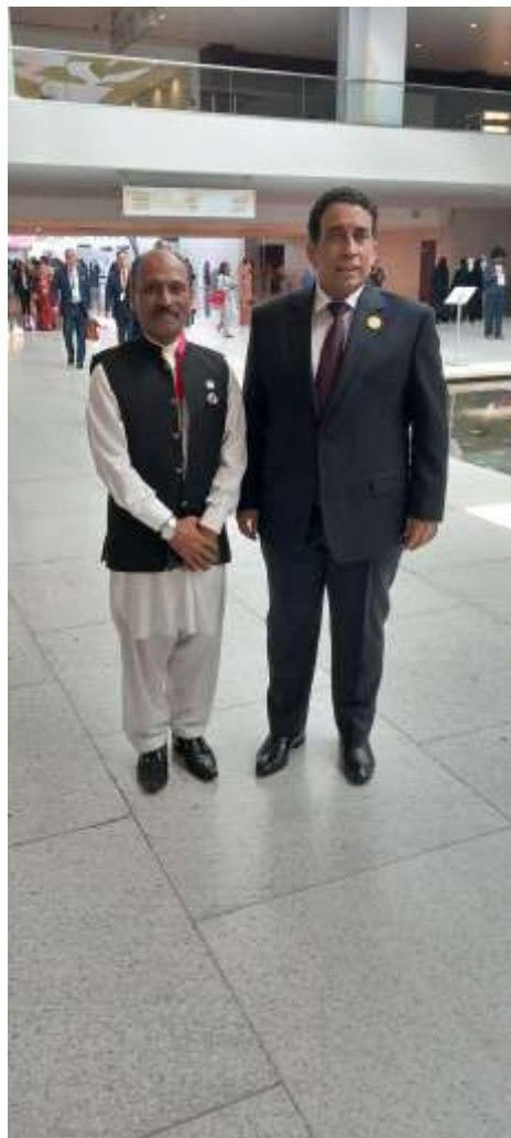
H.E Dr. Mohamed al-Menfi, President of the Presidential Council of the State of Libya meets with IHRC Chief During the summit and agreed to enhance the bilateral relationship between the IHRC and Libya and invited him on official visit to Libya.