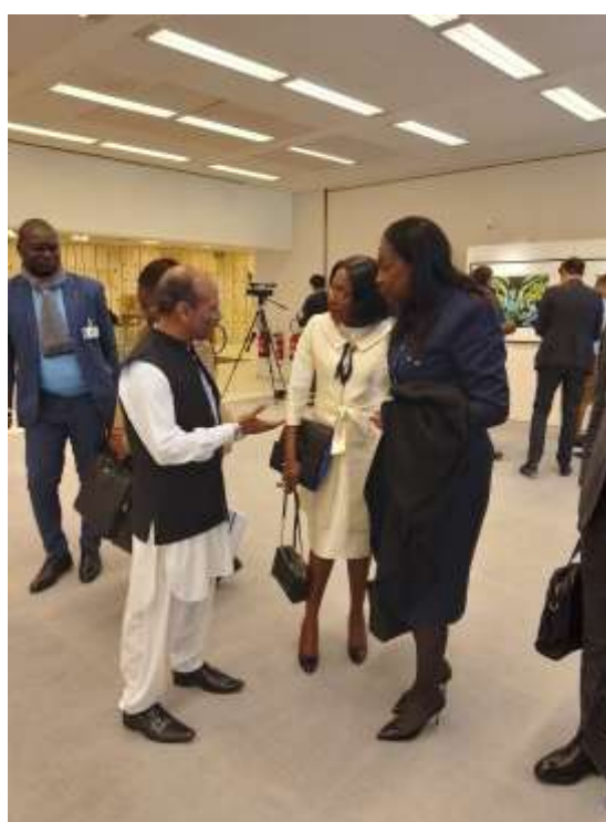
H.E Ms. Erylyne Ndembet Damas, Minister of Justice and Human Rights of Gabon in discussion with the IHRC Chief to enhance the bilateral cooperation between IHRC & Gabon during the 52 nd Session of UN HRC at Geneva, Switzerland