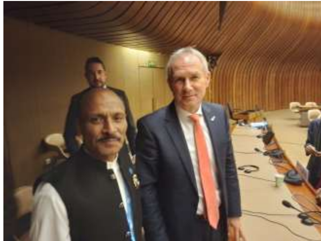
H.E . Csaba Kőrösi, President of 77th UN General Assembly with IHRC Chief after chairing the meeting at UNOG