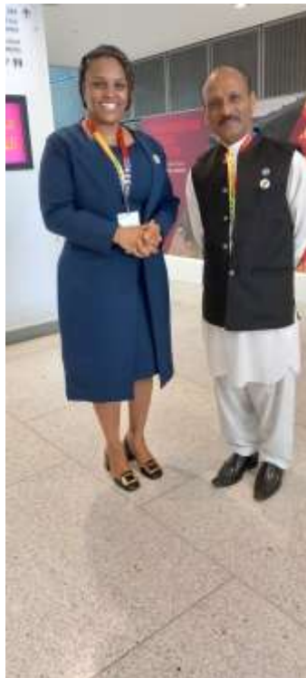
H.E Ms Suzi Carla Barbosa Minister of Foreign Affairs of the Guinea-Bissau meets with IHRC Chief and discussed to strengthen the bilateral relationships between Guinea-Bissau and IHRC as the member state and accepted the invitation to be Keynote speaker at the 7 th World Summit on Human Rights 2024