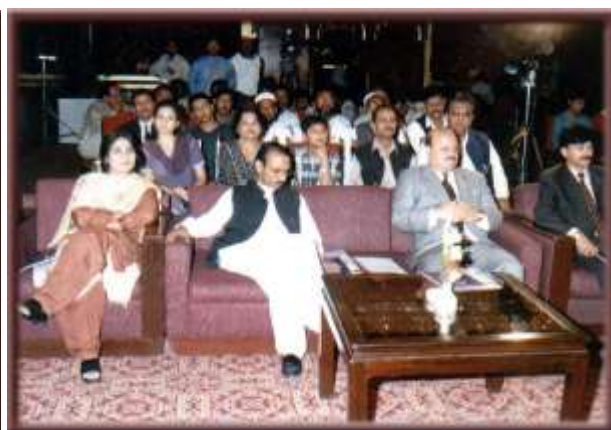
IHRC Chief along with Excellency Barrister Sultan Mehmood Chaudhry Prime Minister of the State of Azad Jammu and Kashmir in the International Kashmir Conference organized by the International Human Rights Commission at Karachi-Pakistan 2001