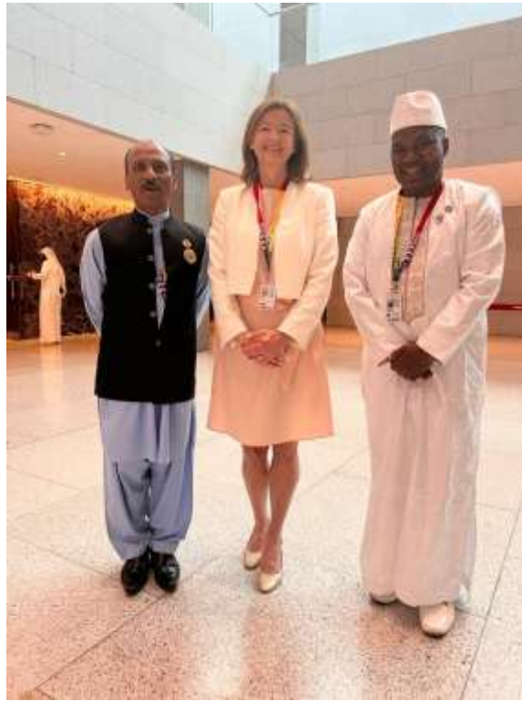
H.E Ms. Tanja Fajon, Deputy Prime Minister & Foreign Minister of Slovenia meets with IHRC Chief and accepted the invitation to be Keynote speaker at the 7 th World Summit on Human Rights 2024 and also discussed to establish the bilateral cooperation between Slovenia and IHRC