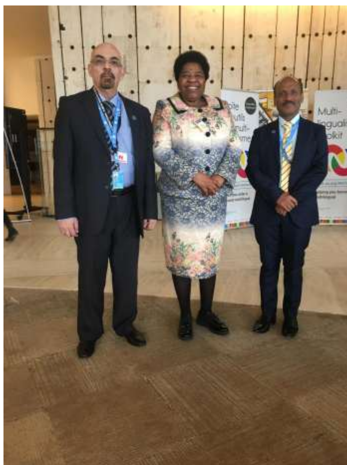
H.E Ms. Candith Mashego-Dlamini, Deputy Minister of International Relations and Cooperation of South Africa meets with IHRC Chief and Deputy High Representative for Foreign Affairs Ambassador Bou Said during the 52 nd Session of UN HRC at Geneva and discussed the matters of cooperation