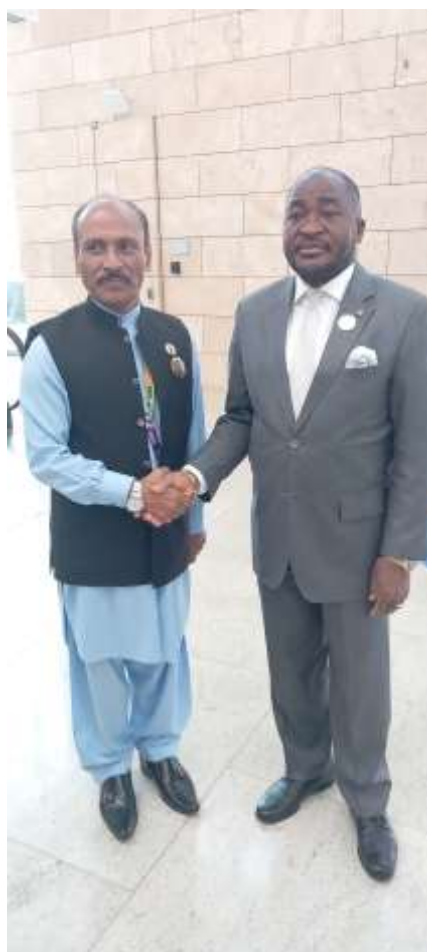
H.E Mr. Dee-Maxwell SaahKemaya Sr, Minister of Foreign Affairs of the Republic of Liberia meets with IHRC Chief and discussed to strengthen the bilateral relationships between Liberia and IHRC and accepted the invitation to be Keynote speaker at the 7 th World Summit on Human Rights 2024