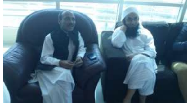
IHRC Chief in discussion with Pakistan Top religious scholar Moulana Tariq Jameel on religious interfaith harmony and tolerance (2017)