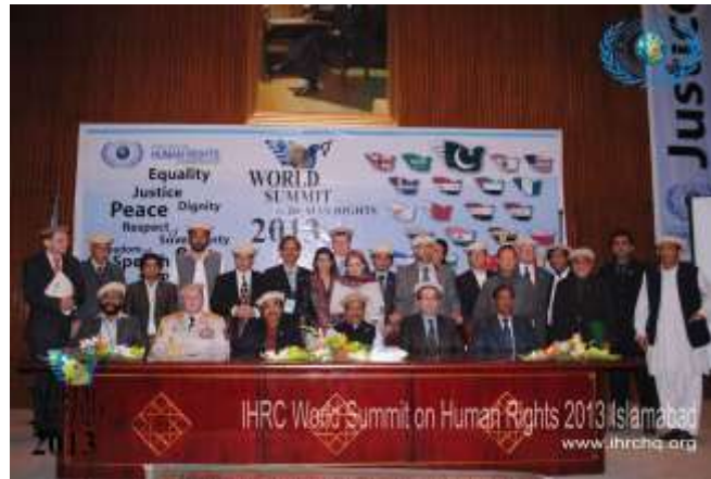
2 nd World Summit on Human Rights 2013 which held at Islamabad-Pakistan from 7 th to 10 th December 2013, in which delegates from 37 countries participated (2013)