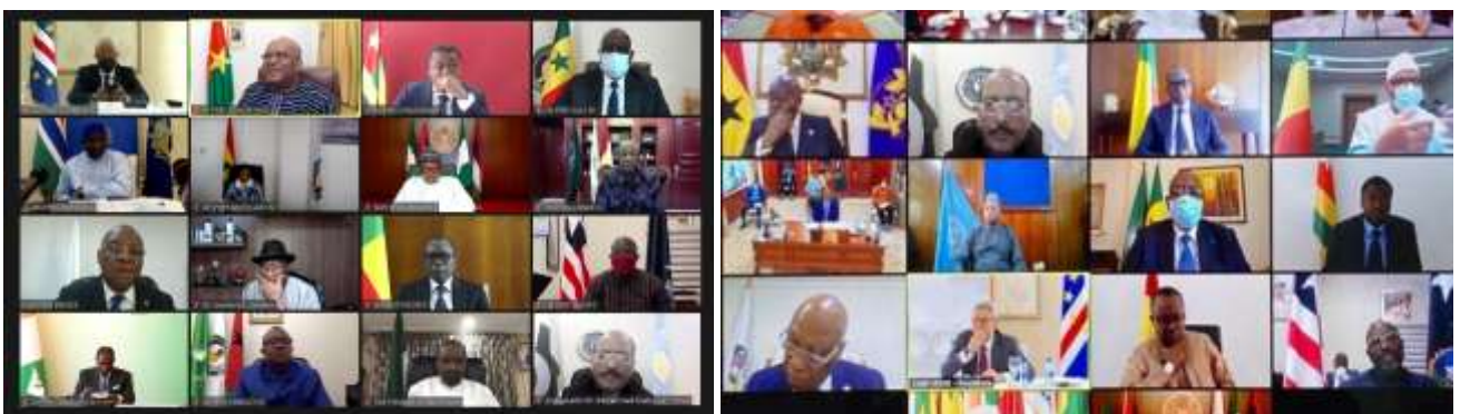
IHRC Chief participated in the Special Session of the African Countries on behalf of the International Human Rights Commission as observer organization (2021)