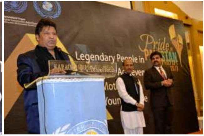
IHRC Chief and Provincial Minister Excellency Syed Nasir Hussain Shah giving the Pride of Pakistan Award 2017 to Pakistani legendry Artist Umar Sharief during the ceremony organized by the International Human Rights Commision at Karachi-Pakistan (2017)