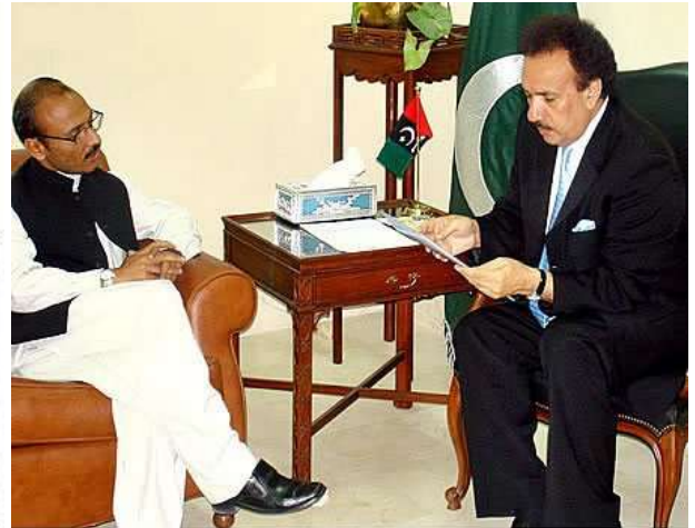
IHRC Chief in meeting with the Prime Minister of Pakistan Excellency Syed Yousaf Raza Gillani and at left presenting bilateral MOU of the International Human Rights Commission to than Federal Minister for Interior of Pakistan Excellency Dr. Rahman Malik (2011)