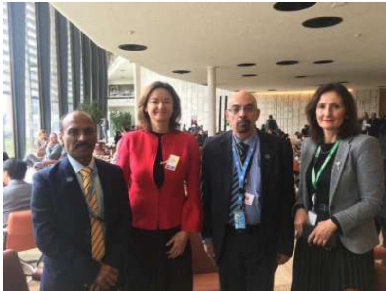
Ms. Tanja Fajon Deputy Prime Minister & Minister for Foreign Affairs of Slovenia meets with IHRC Chief during the 52 nd Session of UN HRC at Geneva, Switzerland and discussed the matters of cooperation between IHRC & Slovenia, Ambassador Bou Said, Deputy High Representative for Foreign Affairs of IHRC and Ambassador of Slovenia H.E Ms. Anita Pipan were also present