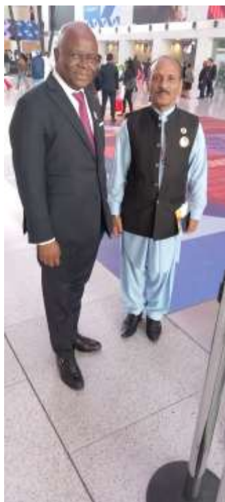
H.E. Mr. Aurélien Agbénonci, Minister of Foreign Affairs of Benin discussed to strengthen the bilateral relationships between Benin and IHRC and accepted the invitation to be Keynote speaker at the 7 th World Summit on Human Rights 2024