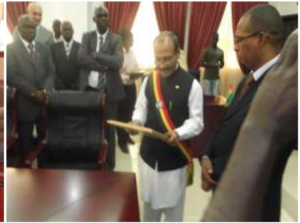
IHRC Chief in Meeting with Prime Minister of Republic of Guinea Bassue Excellency Rui Duarte Barros in office and in the IHRC charter signing ceremony as Co-President of IGRC/ECP (2013)