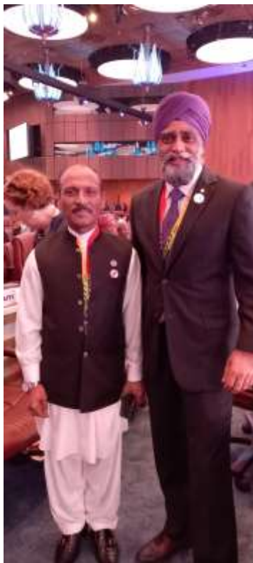
H.E. Mr. Harjit Singh Sajjan, Minister of International Development and PacifiCan of Canada meets with IHRC Chief and discussed the cooperation between IHRC and His office he also accepted the invitation to be Keynote speaker at the 7 th World Summit on Human Rights 2024