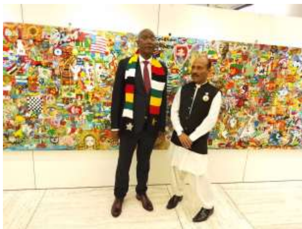
H.E Mr. Ziyambi Ziyambi Minister of Justice, Legal and Parliamentary Affairs of Zimbabwe in discussion with the IHRC Chief to enhance the bilateral cooperation between IHRC and Zimbabwe during the 52 nd Session of UN HRC at Geneva