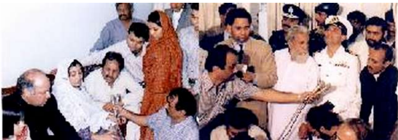
IHRC Chief briefing the Prime Minister of Pakistan Muhammad Nawaz Sharif on the murder case of innocent child in Karachi, which been taken up by the International Human Rights Commission at the level of Supreme Court of Pakistan to provide justice to the family of child (1999)