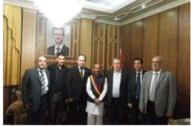
IHRC Chief with the Excellency Omran Ahed al-Zoubi Information Minister and Excellency Najm Hamad al-Ahmad Minister of Justice of the Arab Republic of Syria after signing bilatral cooperation between Syria and IHRC 2012