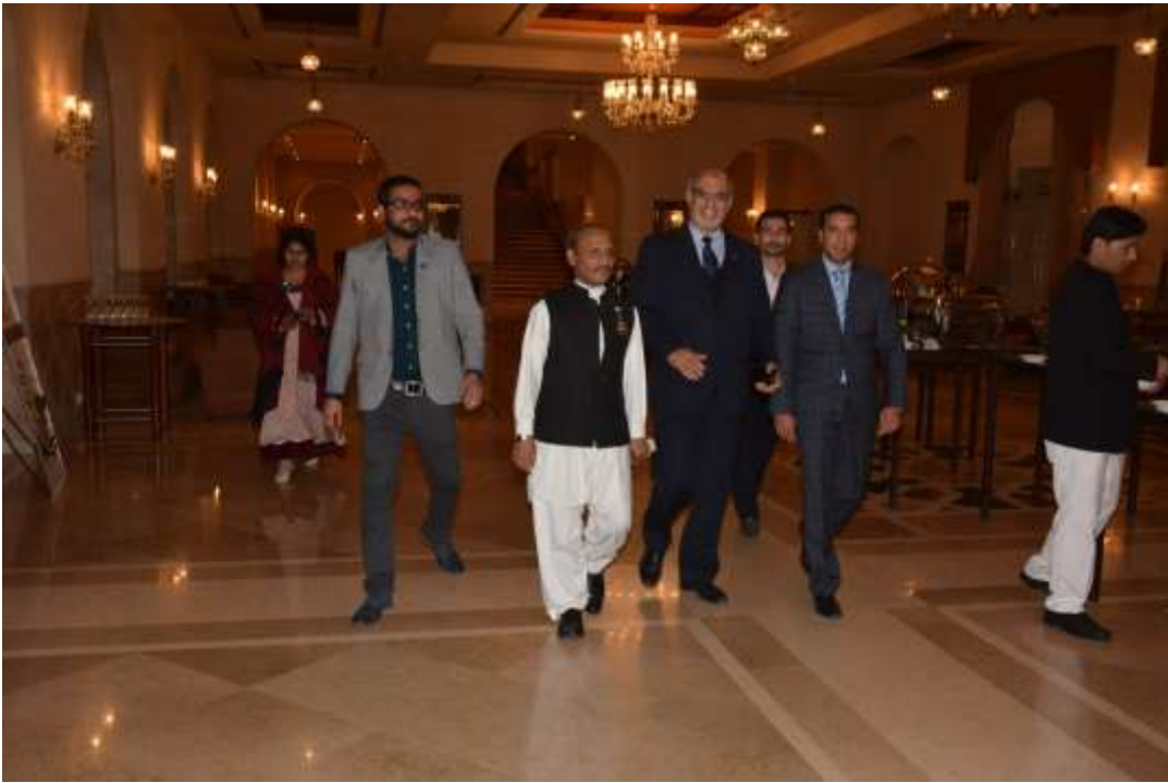
Prime Minister of Tunisia Excellency Hamadi Jabali with IHRC Chief (2016)