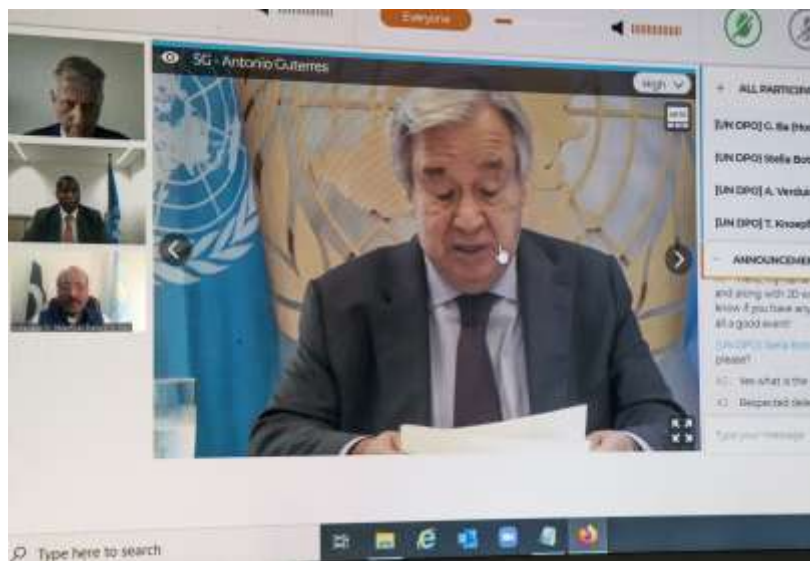
IHRC Chief participated in the briefing of the UN Secretary General on Peacekeeping (2021)