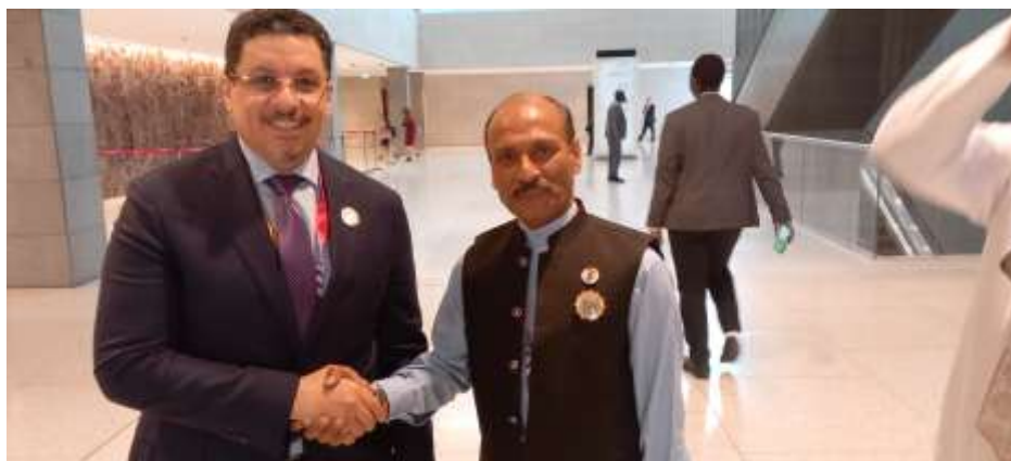
H.E Dr. Ahmed Awad BinMubarak, Minister of Foreign Affairs of Yemen meets with IHRC Chief and discussed to strengthen the bilateral relationships between Yemen and IHRC and accepted the invitation to be Keynote speaker at the 7 th World Summit on Human Rights 2024