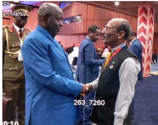
H.E General Evariste Ndayishimiye , President of the Republic of Burundi meets with IHRC Chief During the summit and agreed to enhance the bilateral relationship between the IHRC and Burundi