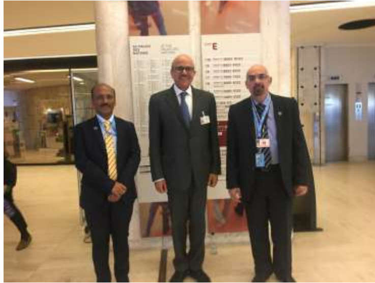
H.E Mr. Abdullatif bin Rashid Al Zayani, Minister of Foreign Affairs Bahrain meets with IHRC Chief and Deputy High Representative for Foreign Affairs Ambassador Bou Said during the 52 nd Session of UN HRC at Geneva and discussed the matters of cooperation between IHRC and Bahrain