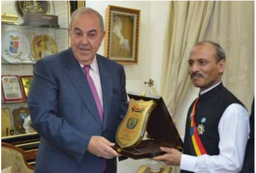
IHRC Chief presenting the Life Time Membership to Excellency President of Lebanon General Émile Jamil Lahoud (2012) and Former Prime Minister of Iraq Excellency Dr. Ayad Allawi (2014)