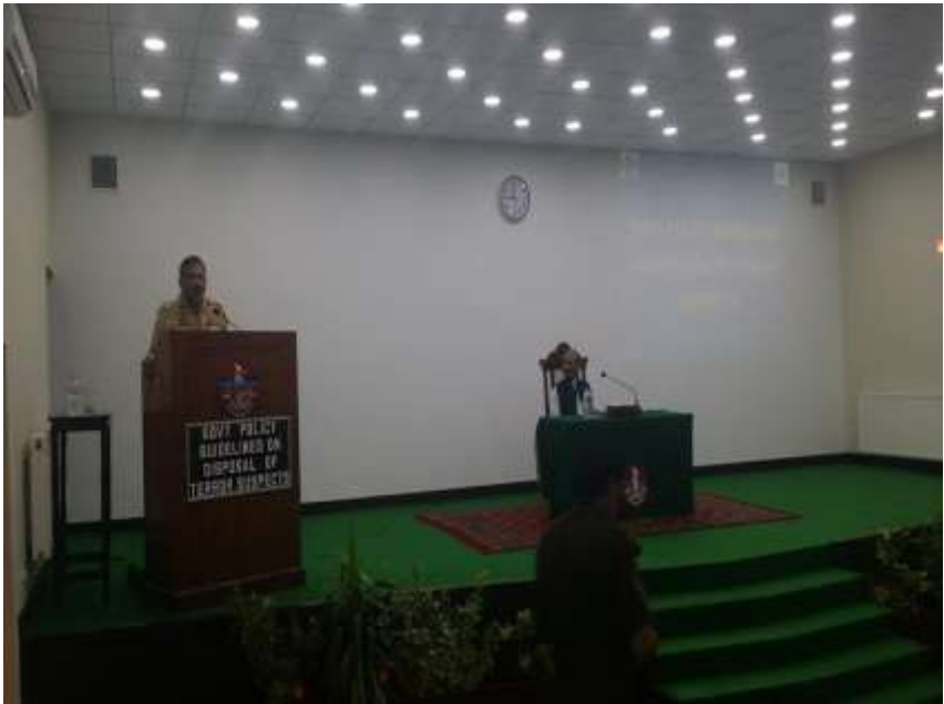
IHRC Chief addressing the Pakistan Army Collage of Intelence at Murree, Pakistan 2015