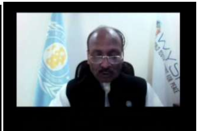
IHRC Chief addressing the Earth Conference organized by the Youth Council Pakistan (2021)