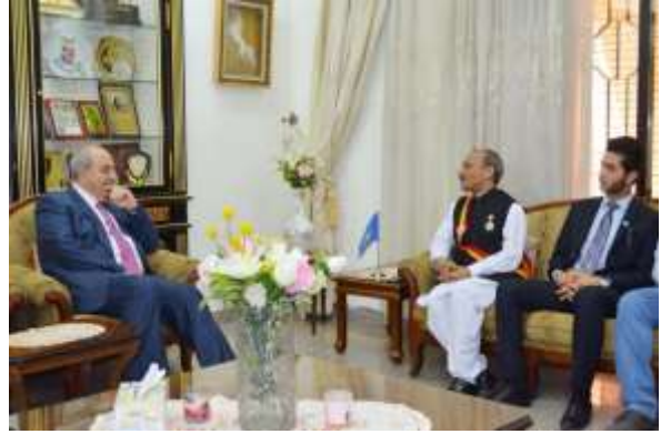
IHRC Chief with the Former Prime Minister & Vice President of Republic of Iraq Excellency Dr. Ayad Allawi as the IHRC Co-President of IGRC/ECP (2014)