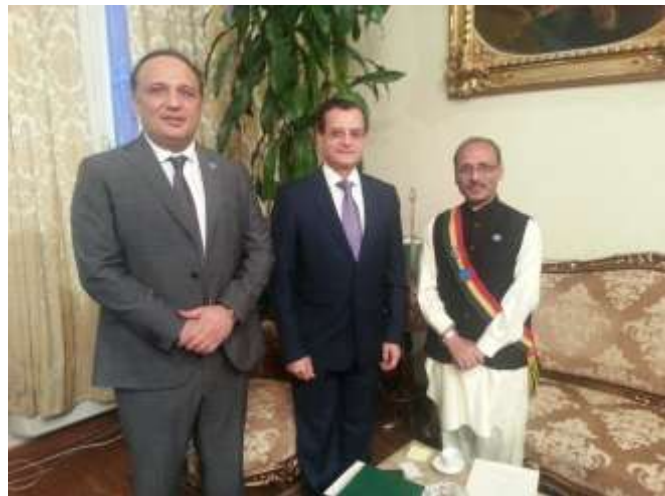
IHRC Chief presenting shiled of honor to the Prime Minister of Lebanon Excellency Tammam Salam and with Foreign Minister Adnan Mansour after MOU Singing between IHRC and Lebanon (2014)