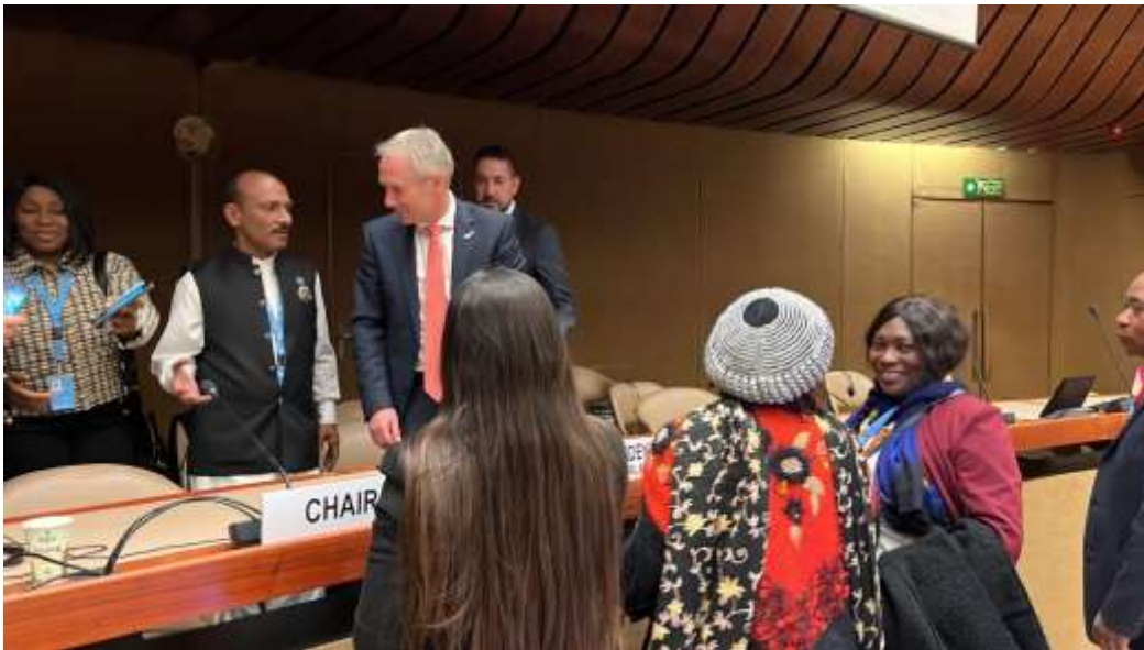
President of the United Nations General Assembly and IHRC Chief in discussion after chairing the meeting at UNOG