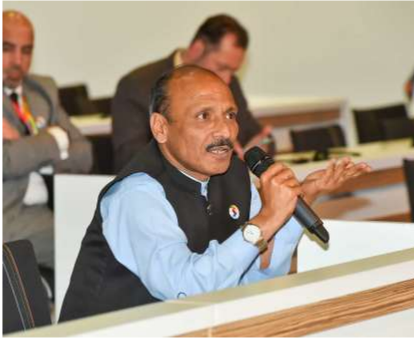
IHRC Chief Addressing the 5th UN LDC 5 Conference at Doha