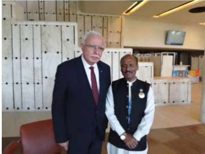
H. E Mr. Raid Al-Malki, Minister for Foreign Affairs, State of Palestine meets with IHRC Chief during the 52 nd Session of UN HRC at Geneva, Switzerland and discussed the matters of cooperation on the ongoing conflict