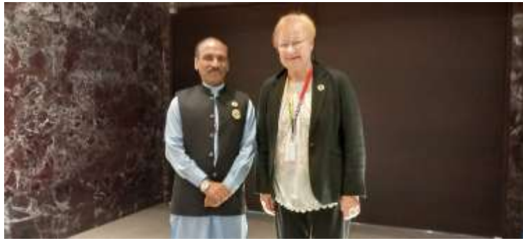
H.E. Former President of the Finland Excellency Tarja Halonen meets with IHRC Chief and accepted the invitation to be Keynote speaker at the 7 th World Summit on Human Rights 2024 at Geneva, Switzerland