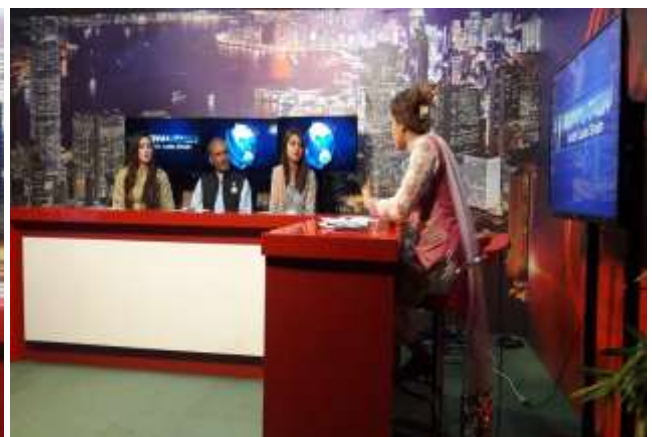
IHRC Chief participating in the TV debate on violence against women and its causes (2018)