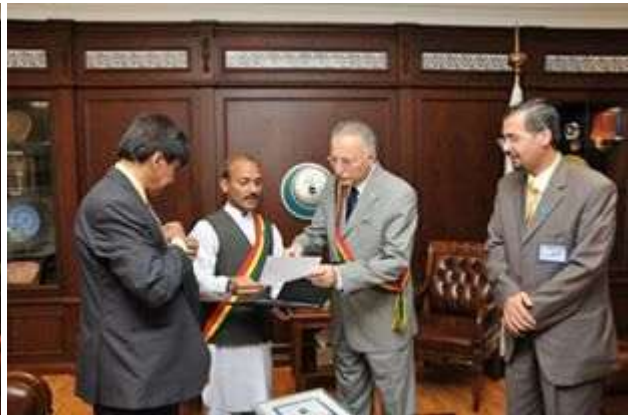
OIC Secretary General Excellency Prof. Dr. Ekmeleddin Ihsanoglu Reciving the International Peace Award 2013 from IHRC Chief and Singning the MOU between IHRC & OIC (2013)