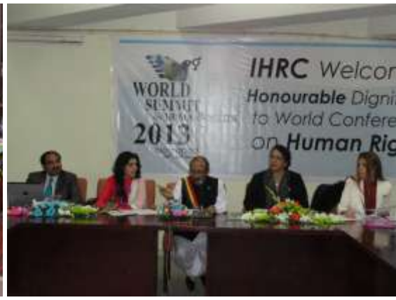
2 nd World Summit on Human Rights 2013 which held at Islamabad-Pakistan from 7 th to 10 th December 2013, in which delegates from 37 countries participated (2013)