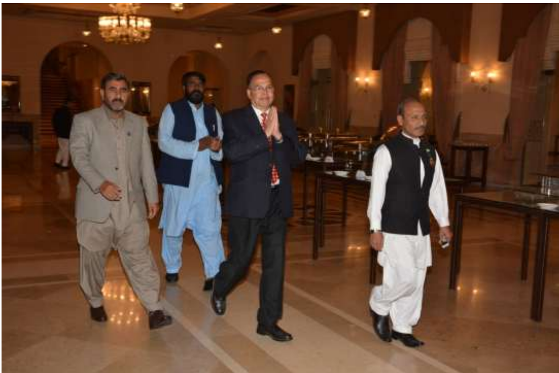
Prime Minister of Nepal Excellency Jhala Nath Khanal with IHRC Chief (2016)