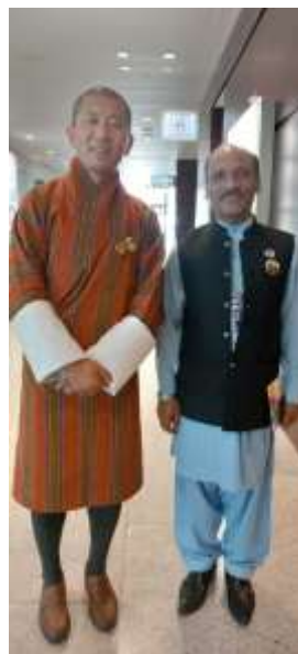
H.E Mr. Lotay Tshering Prime Minister of Bhutan meets with IHRC Chief and accepted the invitation to be Keynote speaker at the 7 th World Summit on Human Rights 2024 at Geneva, Switzerland and also discussed to establish the bilateral cooperation between Bhutan and IHRC