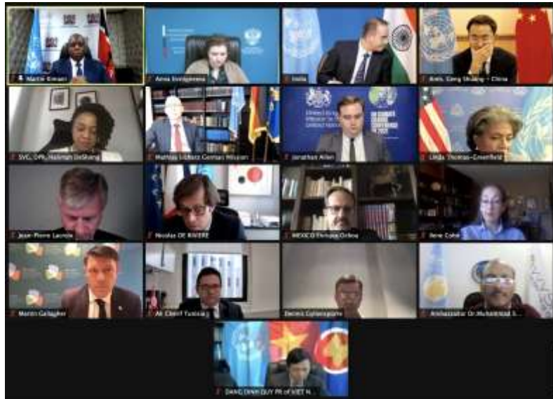
IHRC Chief addressing the United Nations Security Council Special Session (2021)

COMPLIED BY IHRC DEPARTMENT OF PUBLIC INFORMATION