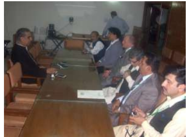
IHRC Chief in meeting with the Governor of Sindh-Pakistan Excellency Usman Ismail of along with Foreign Delegates on election reforms in Pakistan (2013)