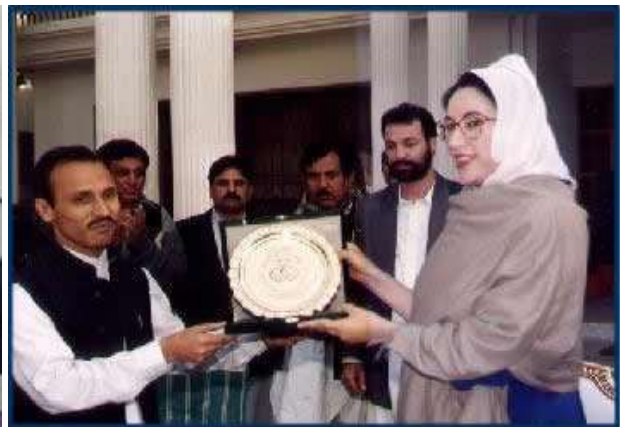
Prime Minister Pakistan Mrs. Benazir Bhutto been Awarded International Peace Award and receiving the Credentials of the Commission in 1993 & 1996