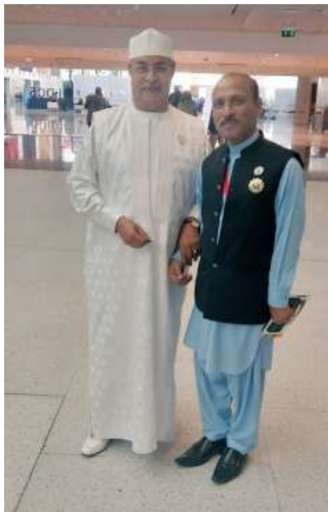
H.E Annadif Khatir Mahamat Saleh, UNSG Special Representative for West Africa & the Sahel ( Former Foreign Minister of Chad) meets with IHRC Chief and discussed the cooperation between IHRC and His office he also accepted the invitation to be Keynote speaker at the 7 th World Summit on Human Rights 2024